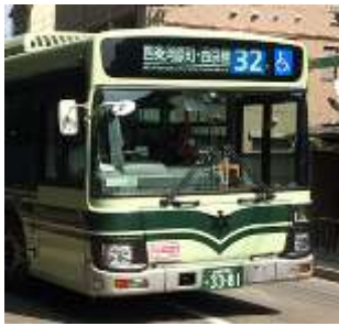
Kyoto City Bus